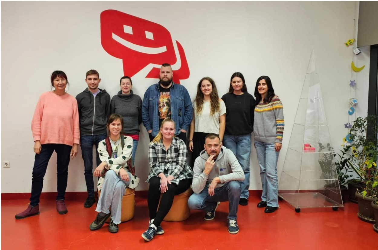
CARPE DIEM Team – employees and ESC volunteers

2 Accreditations – Erasmus + in the field of youth and European Solidarity Corps (ESC)